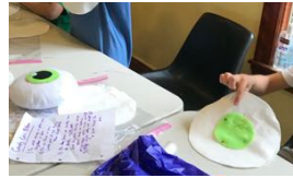
MAKING EYEBALL PILLOWS