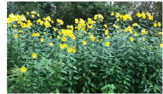
WILD FLOWERS AT COLD SPRING PARK IN FALL BLOOM