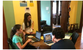
NEW HOMEWORK COMPUTER STATION