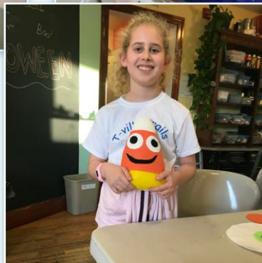
Scary eyeball & candy corn pillow making and charades.